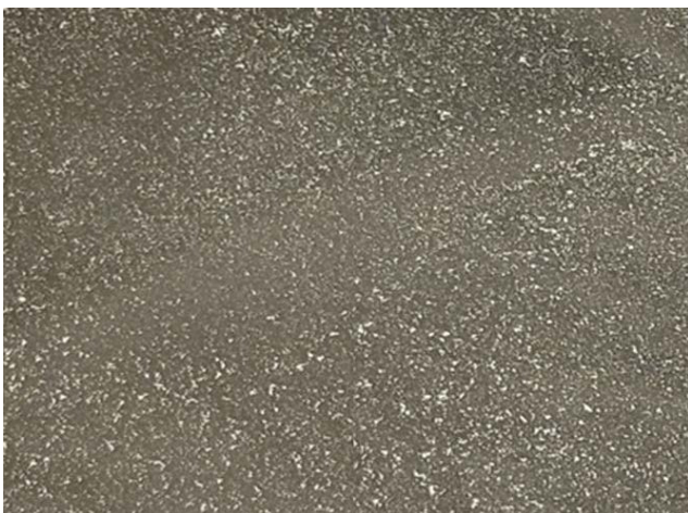
Spray pattern for bonding Pro Series AMB 2000 to the substrate "Light Spray Method"