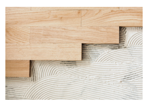
LESS ADHESIVE AMB 2000 underlay floats, flooring

is adhered to AMB 2000 reducing adhesive usage by 50% or more.