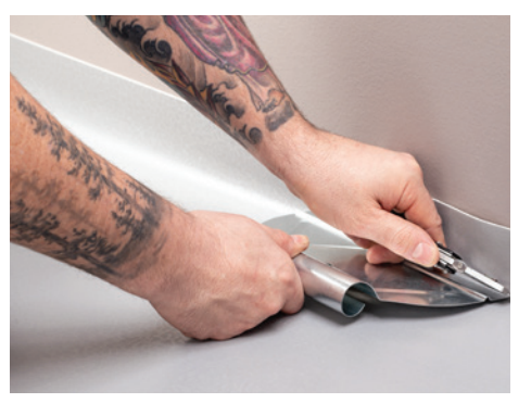
SECURE + STABLE

Suppresses moisture migration to the flooring system from the top surface of concrete for internal relative humidity levels to 100%.